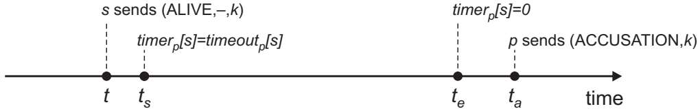
Fig. 8 Timeline of events in proof of Lemma 46.

To show the claim, consider any process q \neq \ell , and suppose that condition (i) does not hold, i.e., suppose that q \in active_p holds infinitely often. We now show that condition (ii) is satisfied. By Lemma 33, q is correct, and for every time t , there is a time after which counter_p[q] \geq counter_q^t[q] . There are two cases: